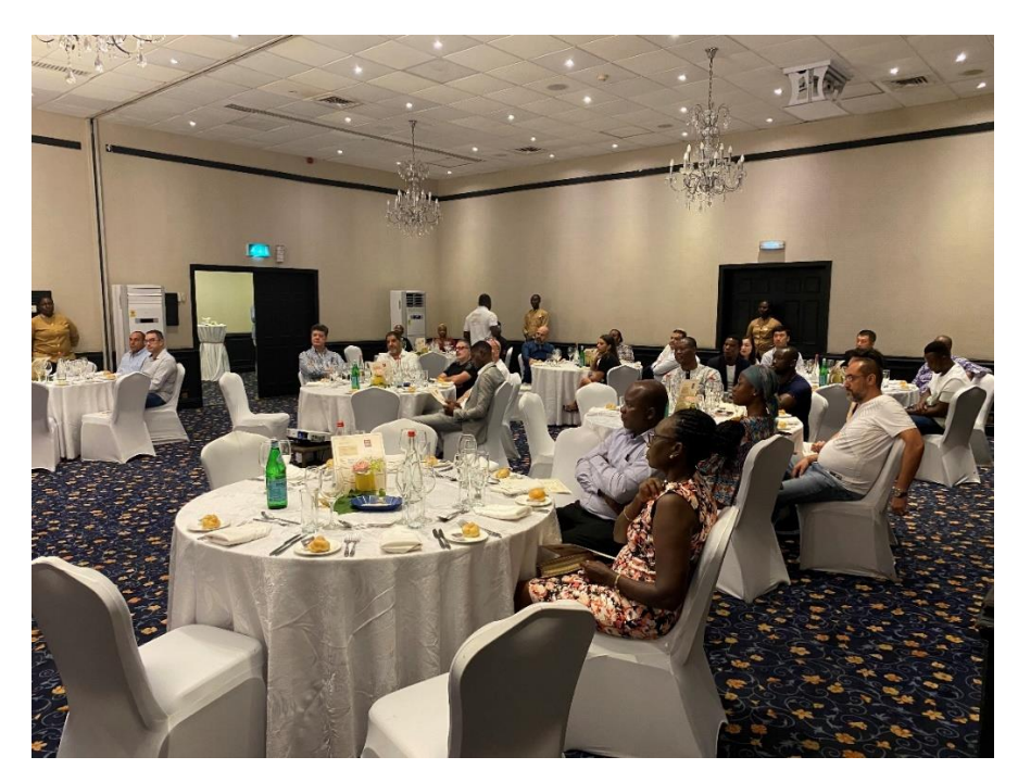
Guests at the Wine Tasting and Food Pairing