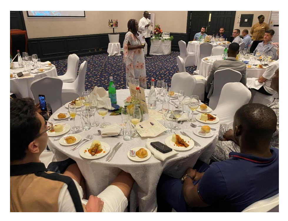
The Chef and Sommelier taking guests through the distinct wine food on the night.