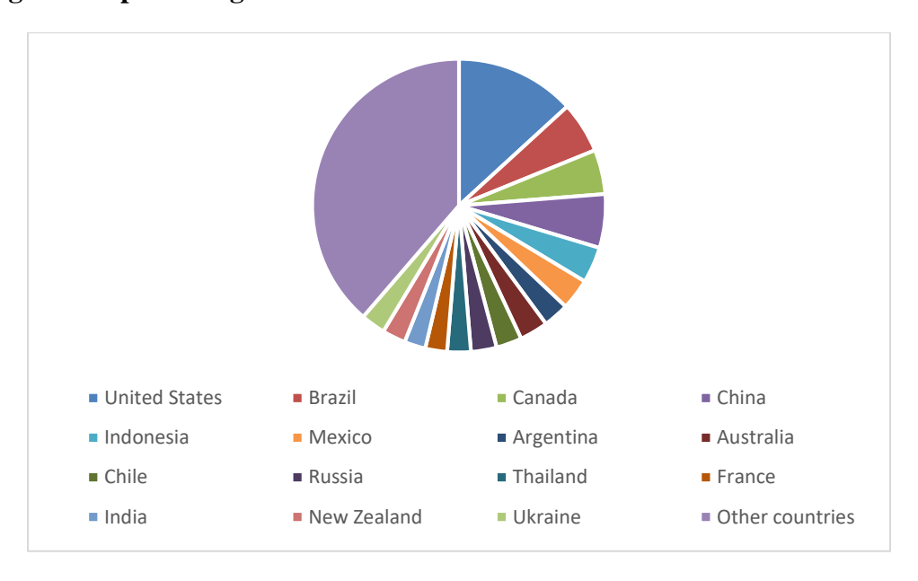
Chart 2: Origin of Imported Ag & Related Products in 2022

In 2022, Israel's imports of agricultural and related products<sup>1</sup> stood at $13.7 billion. The United States is the largest supplier with a market share of 13.2 percent. The main competition for the US is the EU due to its vicinity and pricing.