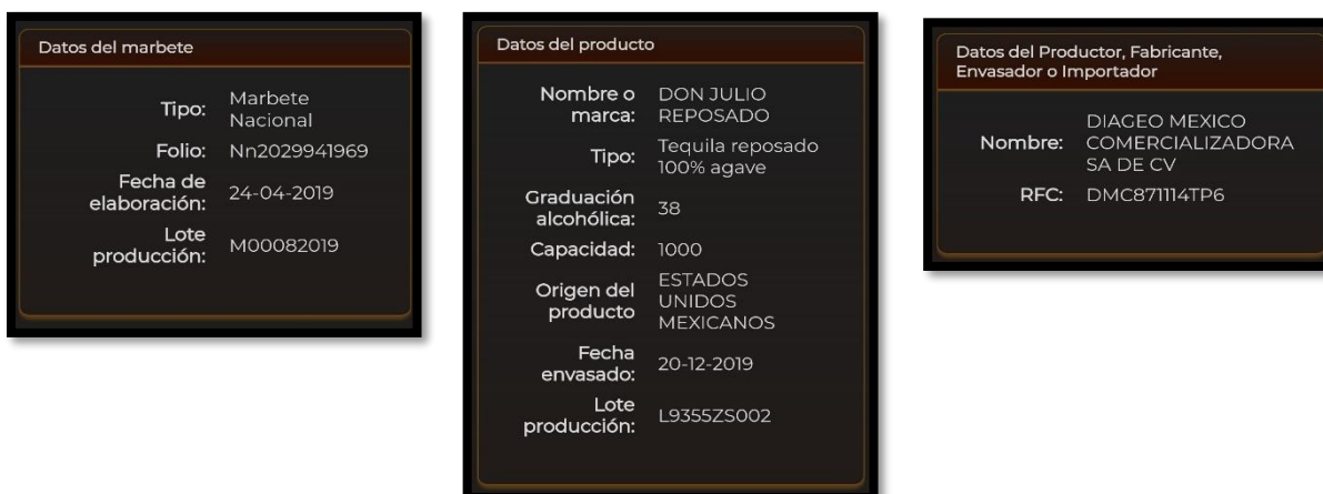
Figure 4. Information the marbetes (QRs) provide.

The QR code directs to a website with the product's information. An example below: