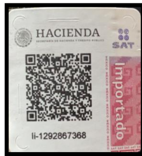
Figure 3. Marbete from imported product.