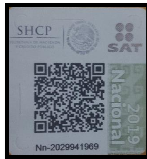
Figure 2. Example of marbete from 2019.